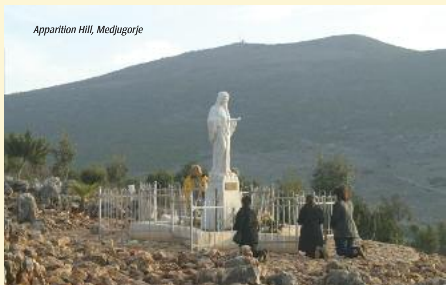
Apparition Hill, Medjugorje

Medjugorje is really a place of peace. It is also a place of joy and I encourage everyone to experience this message of peace and share it with others. That's the way that we're going to help Medjugorje get out into the world.