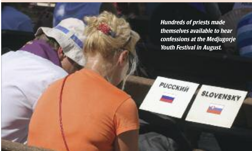
Hundreds of priests made themselves available to hear confessions at the Medjugorje Youth Festival in August.

I kiss the wounds that heal... and heal the wounds I kiss.